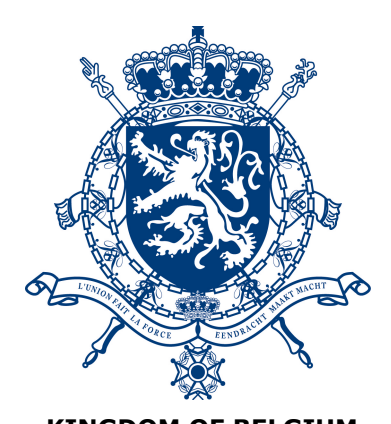
KINGDOM OF BELGIUM Foreign Affairs, Foreign Trade and Development Cooperation