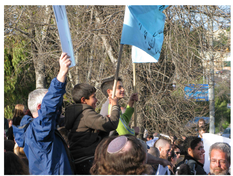
Palestinian children and Israeli peace activists at the weekly demonstration in Sheikh Jarrah.