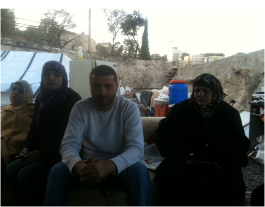
( \mathit{left}) Site of the demolished house of the Subuh family in Ras Al-Amud, East Jerusalem. ( \mathit{right}) Subuh family members sit at the site where their house was demolished two days earlier, on 21 December 2010.

The delegation spoke to one family member who was a lawyer and she did not know of any "official document" sent before the actual demolition order was nailed to the gate of the house. However, six months before the eviction took place, the army attended the premises without notice and broke through the gate. They interrogated her father as to why he and others were living at the premises. They did not mention their intention to seek an order.