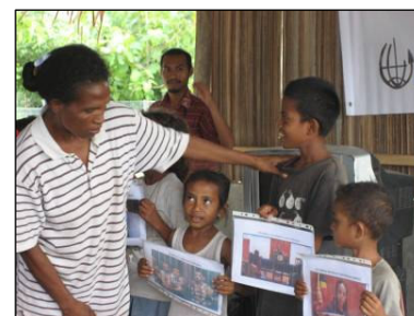
Game to teach about the steps in the formal justice process

During community workshops, ASF engaged local experts from government and the private sector to give presentations and then facilitators lead open discussions on the topic of the day. ASF also used live drama and film whenever possible to demonstrate the messages clearly and ensure that people of all ages and education levels can understand. Through these strategies, ASF were empowering the disadvantaged to seek peaceful resolution of disputes through the formal justice system and other appropriate avenues.