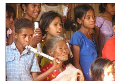
Old woman and young children at community legal education session

During community workshops, ASF engaged local experts from government and the private sector to give presentations and then facilitators lead open discussions on the topic of the day. ASF also used live drama and film whenever possible to demonstrate the messages clearly and ensure that people of all ages and education levels can understand. Through these strategies, ASF were empowering the disadvantaged to seek peaceful resolution of disputes through the formal justice system and other appropriate avenues.