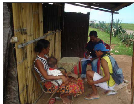
ASF team interviewing family in remote village

In order to respond to these immediate needs, beginning in 2007 ASF has been actively working with Timorese lawyers to provide free basic legal advice to the population, beginning first with a pilot project in the city of Dili and expanding mobile legal clinics into the district of Cova Lima in late 2008. The team of lawyers was specially trained to provide appropriate and practical advice in simple terms, and to refer clients to other service providers who can assist them to resolve all related aspects of their situation, whether they are legal or otherwise. The advice activity was closely linked with awareness raising sessions within the communities, which ensures a wide reach and builds confidence of the public in the justice system.