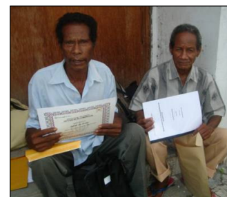
Community Legal Liaisons with their certificates

ASF has developed an innovative and far-reaching methodology to raise awareness and understanding of the formal justice system and the most important legal issues facing rural communities, working hand in hand with local partners. Priority topics identified by the target population include land and property disputes, domestic violence and gender issues, basic process in criminal cases, human rights, the court system, and child rights. Through lively community workshops and various audiovisual materials, ASF disseminated practical information to communities about laws and rights. Our outreach to the village level ensures that the maximum number of people is reached, with active participation from all gender and age groups.